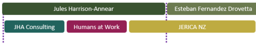
Figure 2: Organisational structure showing business units included and excluded

However, the ownership structure of our companies present the opportunity to report together.